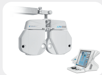
Direct control from APH 550 automatic phoropter console